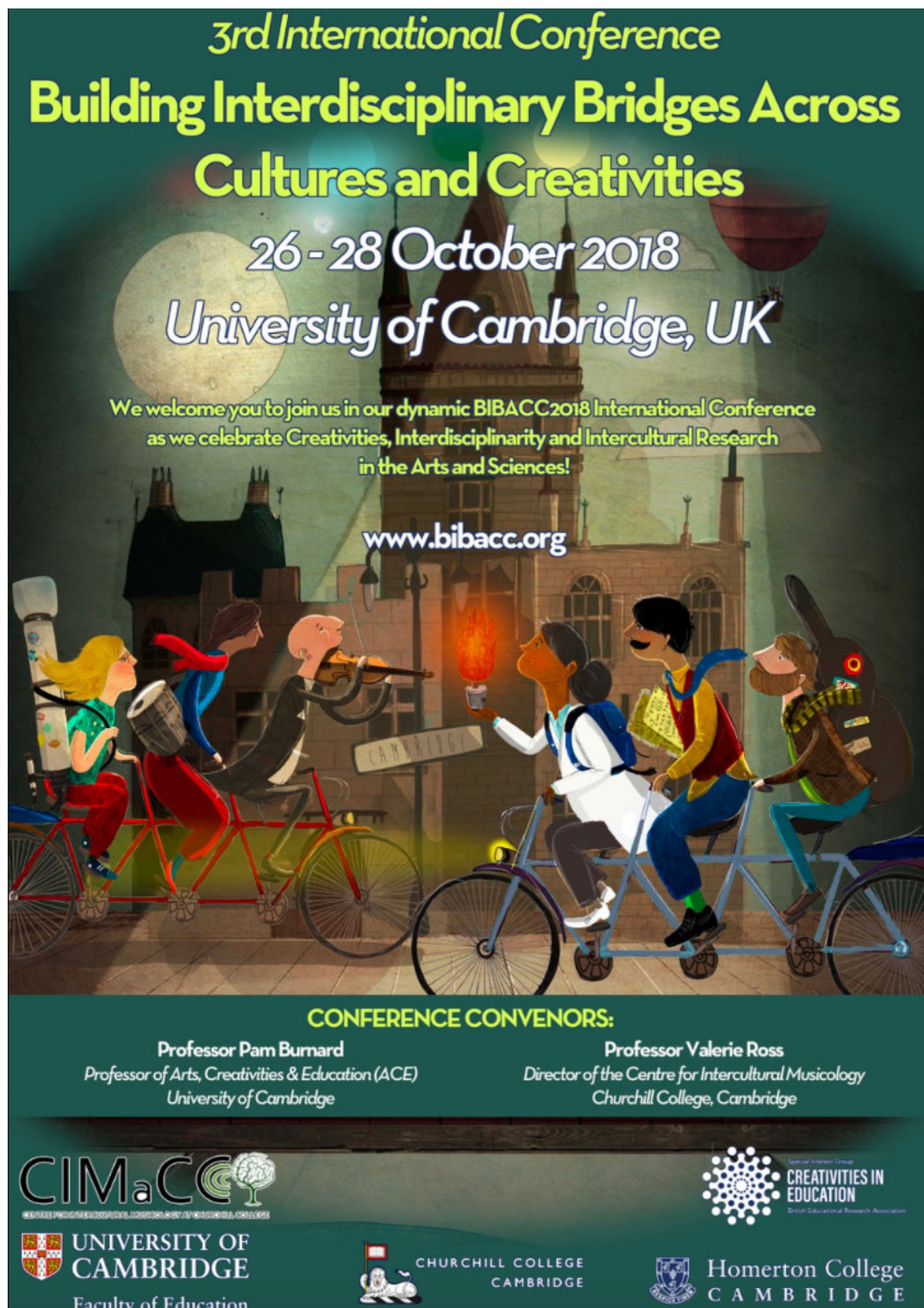
BIBACC 2018 Conference Flyer